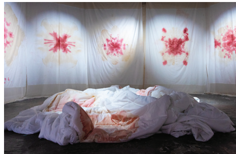
Domestic Bodies 126 Gallery, Galway 2024.