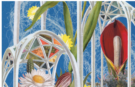
Botanical Bliss, detail, 2023, Digital Collage, Anthony D Kelly.

A co-commission by Riverbank Arts Centre, Linenhall Arts Centre and Kildare County Council Library Service.