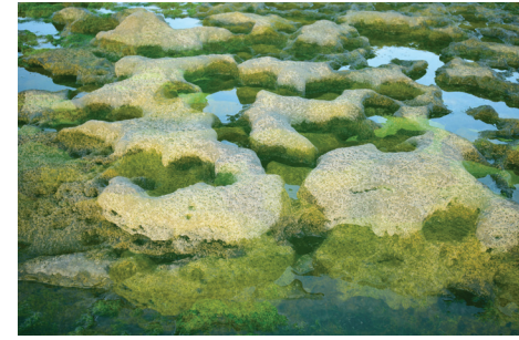
Blooming erosion from the Future Fossil Series, Photographic work, 2024.

In this exhibition of new work, inspired by excavations into personal history connected to the Co. Mayo area and the sea, Kelly explores the notion of hidden histories, connection and identity, both individual and collective.