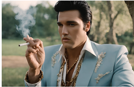
Dream, AI Generated Film Still, Drop 29mins, 2024.