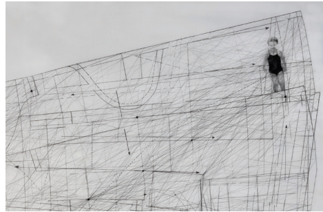
The Mesh of Life, 2024, detail.

Drop revolves around merging painting and cinema, meticulously exploring the temporal aspects of both mediums through hybridisation by intertwining elements of painting, animation, AI generation, and performance.